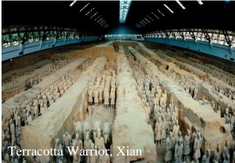
Terracotta Warrior, Xian

Departure Dates for 2012: 2 Apr, 21 May, 18 Jun, 16 Jul, 20 Aug, 17 Sep & 22 Oct