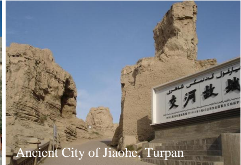
Ancient City of Jiaohe, Turpan

Day 1 Hong Kong → Xian Approx. 2.5 hours flight (Hong Kong Airlines or China Eastern Airlines)