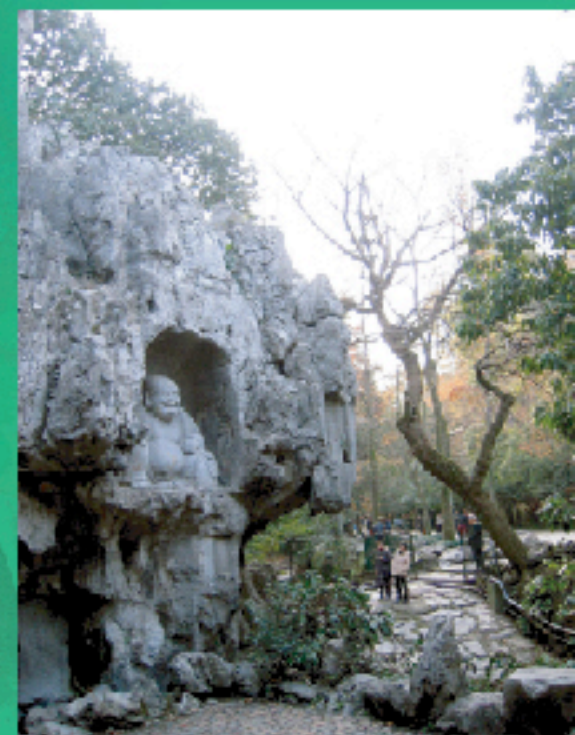
Peak Flying-From-Afar, Hangzhou 杭州飛來峰