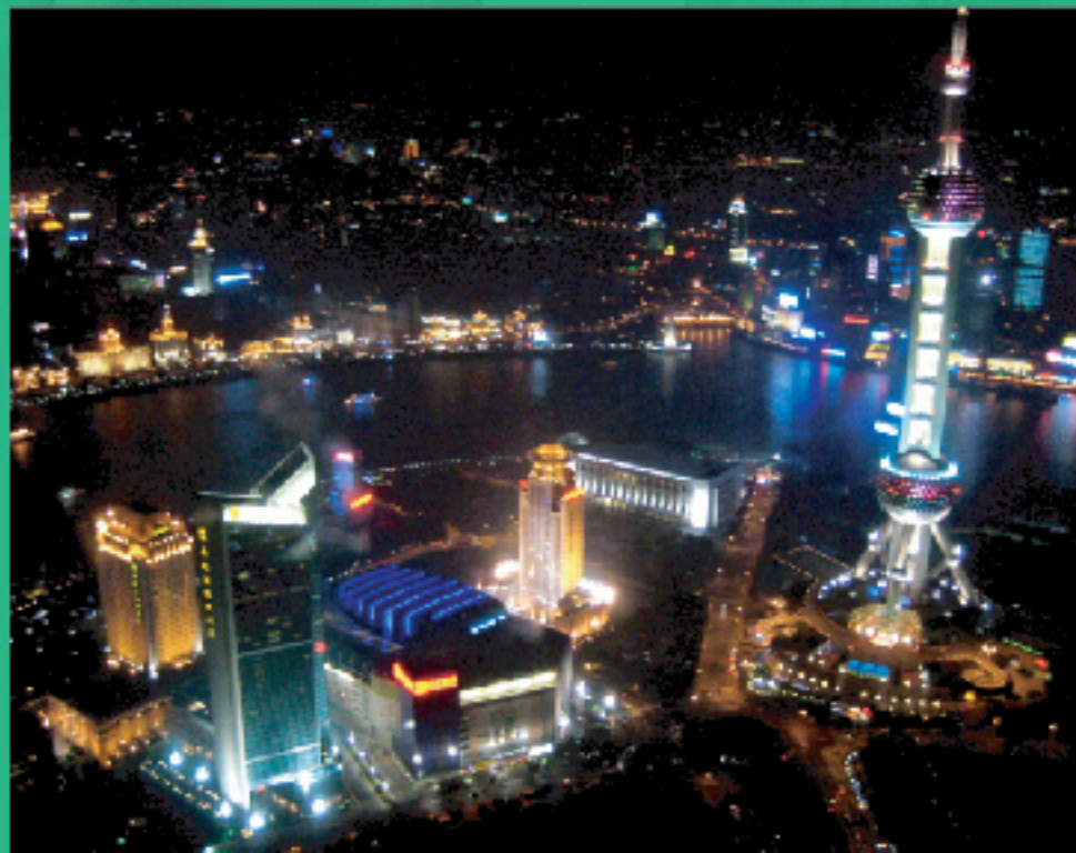
Night view of the Bund, Shanghai 上海外灘夜景