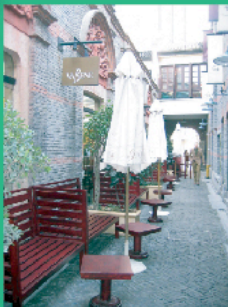
Xintiandi, Shanghai 上海新天地

行程 (二) : 六天南京、杭州、蘇州、上海 Itinerary B: 6 Days Nanjing, Hangzhou, Suzhou & Shanghai Tour