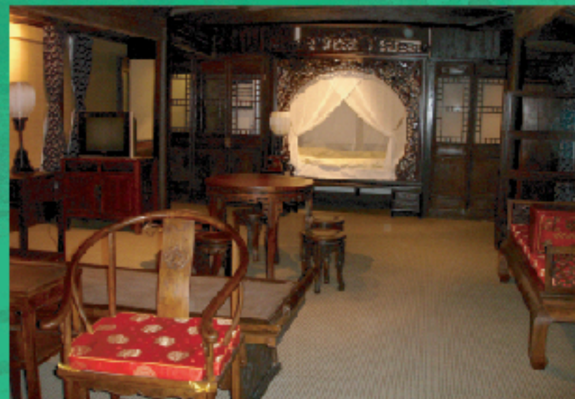
Pingjiang Lodge, Suzhou 蘇州平江客棧