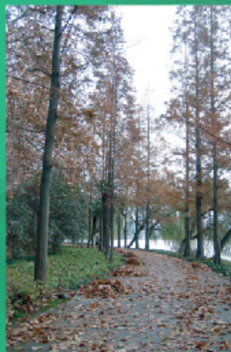
Xuanwu Lake, Nanjing 南京玄武湖