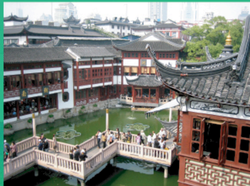
Yuyuan Garden, Shanghai 上海豫園