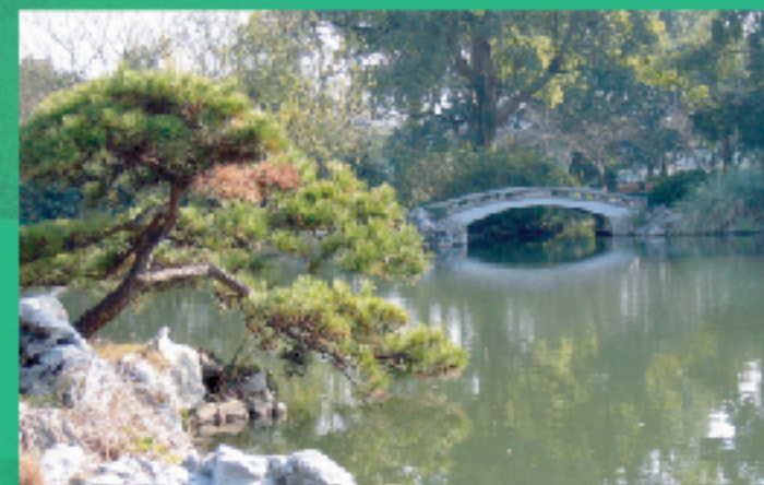
"Viewing Fish at Flower Pond" at West Lake, Hangzhou 杭州西湖十景之一"花港觀魚"